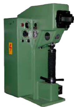
REICHERTER MOD. BVR 250