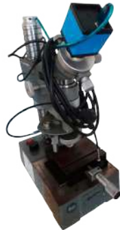
LEITZ (camera – software separated cost) MOD. MINILOAD 1 HV 0.01-0.025-0.05-0.1-0.2-0.3-0.5-1 Test Load: 10-25-50-100-200-300-500-1000 gr