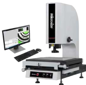
VIDEO MEASURING SYSTEM MOD. VMA 3020