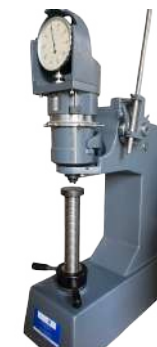
REICHERTER MOD. BRIRO AUT