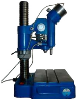
ZWICK + camera MOD. Z 323 HV 0.3-0.5-1-2-3-4-5-10 Test Load: 0.3-0.5-1-2-3-4-5-10 Kg