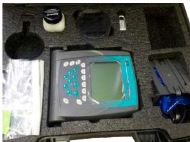
LEEB HARDNESS TESTER MOD. EQUOTIP 3