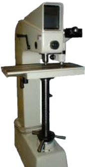
GALILEO MOD. HV HV 5-10-20-30-50 Test Load: 5-10-20-30-50 Kg