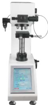
THV 1 HV 0.01-0.025-0.05-0.1-0.2-0.3-0.5-1 Test Load: 10-25-50-100-200-300-500-1000 gr